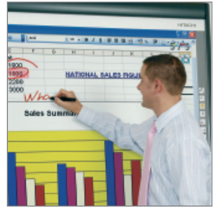
IDEAL FOR STUDENT INTERACTION