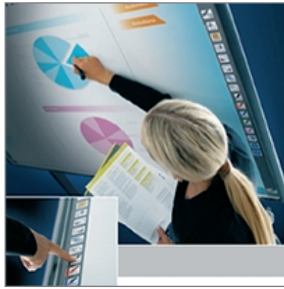
SIDE TOOLBAR ACTIVE AT ALL TIMES