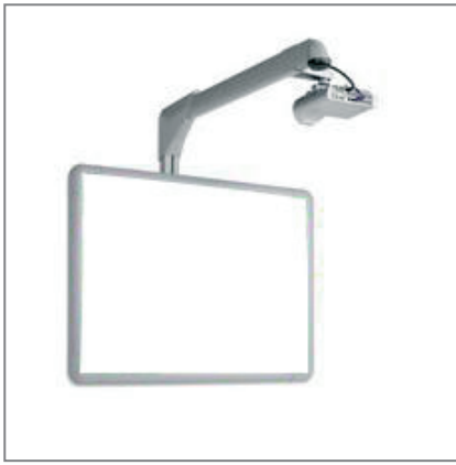
WALL-MOUNTED INTERACTIVE BOARD