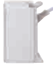
Advanced Finisher. Ideal for basic binders, manuals, reports and presentations. This finishing option offers 50-sheet, multi-position stapling and 2, 3 or 4 hole punching.