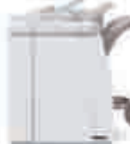
Light Production Finisher.* This finishing option enables coated booklets up to 100 pages, brochures and bi-fold mailers as well as stacking, stapling and hole punching. It also includes an interposer input tray. Even more versatility can be obtained with the addition of the optional tri-fold, Z-fold and tabloid Z-fold module for this finisher.