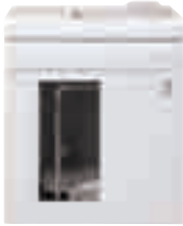
High-Capacity Stacker.* 5,000-sheet stacking for long production runs.