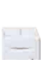
High-Capacity Feeder. Holds 2,000 sheets in a wide range of weights.

Professional feeding and finishing are the beginning and end of the perfect job. The Xerox® 700i Digital Colour Press gives you all the options you need to make anything from coated brochures, newsletters, presentations, direct mail, booklets and more... a great success.