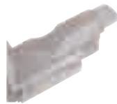
Offset Catch Tray. 500-sheet stacking.