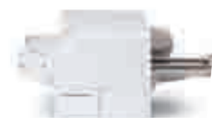
Xerox® SquareFold® Trimmer Module. Enhances the power of the Light Production Finisher with booklet maker with highly desired features, such as square fold of cover sheets and face trimming to produce booklets.