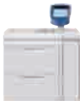
Oversized High-Capacity Feeder. Ideal for signature booklets and other high-end applications.