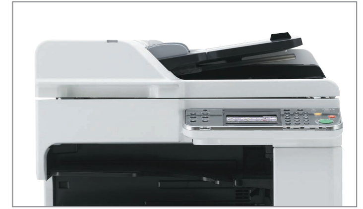
STANDARD DOCUMENT FEEDER