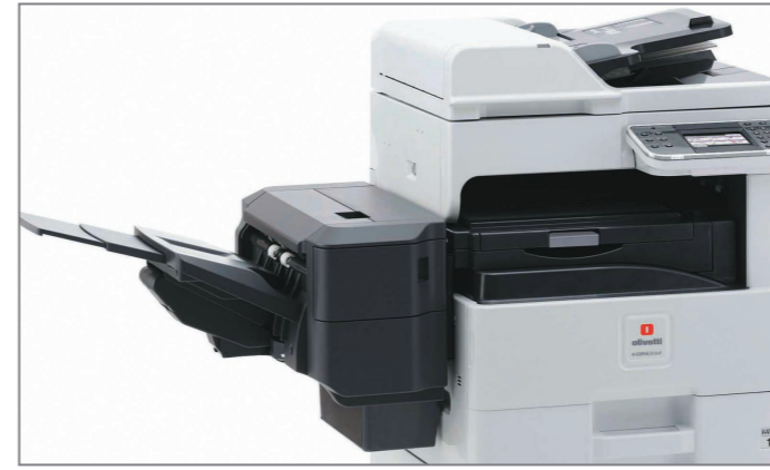
EXTERNAL FINISHER (optional)