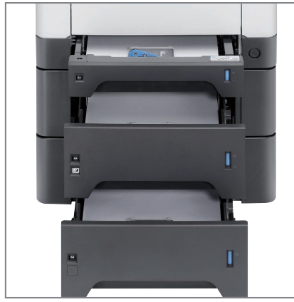
HIGH PAPER HANDLING FLEXIBILITY