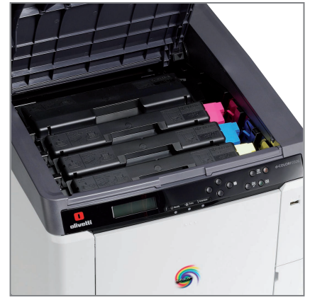
EASY CONSUMABLES REPLACEMENT